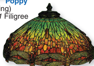
T1507 22" Dragonfly (5" Ring) Use F1507 Filigree