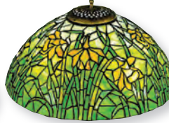
T1449 16" Daffodil (4" Ring)