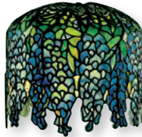
T349 10" Mini Wisteria C349 - Crown