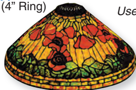
T1531 20" Poppy (4" Ring) Use F1531 Filigree