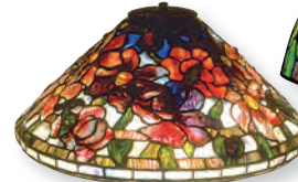
T1563 16" Peony (3" Ring)