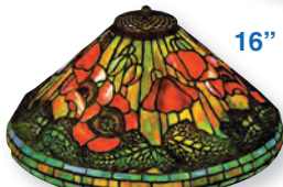
T1461 16" Poppy (3" Ring) Use F1461 Filigree