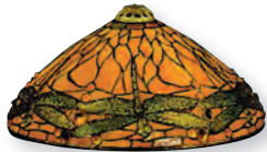
T1585 14" Dragonfly (2" Ring) Use F1585 Filigree