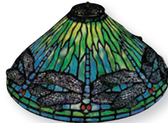
T1462 16" Dragonfly (3" Ring) Use F1462 Filigree