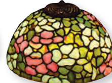
T1417 12" Dogwood (3" Ring)