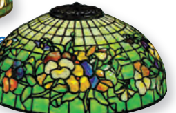
T1448 16" Pansy (4" Ring)