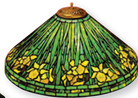
T1497 20" Daffodil (4" Ring)