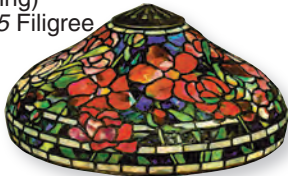
T1475 18" Peony (4" Ring)