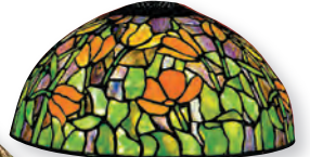
T1560 14" Tulip (4" Ring)