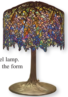
T342 - 18" Wisteria B342 - Tree Trunk Base C342B - Crown w/Branches