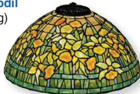
T1449R 16" Banded Daffodil (3" Ring)