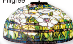
T1598 18" Oriental Poppy (4" Ring)