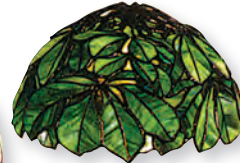
S121 12" Sculptural Chestnut #CR101 Crown