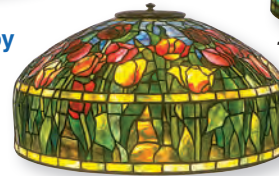
T1596 18" Tulip (4" Ring)