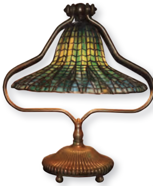
T422 - 15" Lotus Bell WB42 - Harp Base