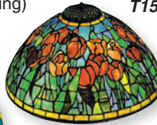
T1906 16" Tulip (4" Ring)