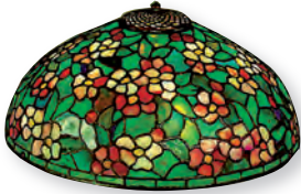
T1455 16" Apple Blossom (4" Ring)