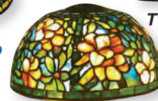
T1404 10" Azalea (3" Ring)