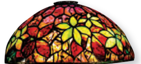
T1468 16" Woodbine (3" Ring)