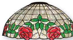
#GF16-1 Stylized Rose