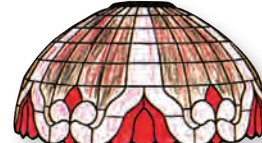
#GF16-3 Molcany Nouveau