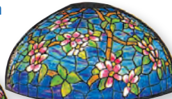
#GF16-8 Apple Blossom