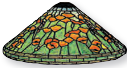
#C16-7 Desert Poppy-3"