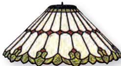
#C16-1 Art Nouveau-4"