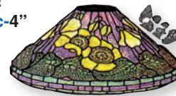
#C16-5K Poppy w/Filigree-4"