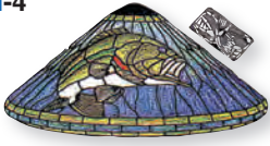
#C16-9K Bass w/Filigree-3"