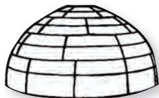
#GF16P 16" Dia. Full Form